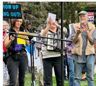
Show Up! Sing Out! at the Holyoke Labor Day parade and protest, September 1, 2023.