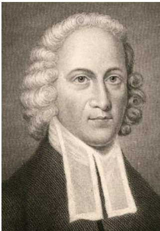
Jonathan Edwards 2