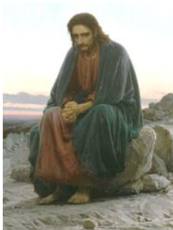
Christ in the Wilderness! by Ivan Nickolaevich Kramskoi

When Lent begins on Ash Wednesday, February 22, I will be as ready as I can be to lead us – truth be told, it will be more like “help us all to explore and reconsider” than lead us – through a series of sermons on traditional Christian ideas that are so familiar to some and so off putting to others that they often are left unnamed or treated as no-go topics.