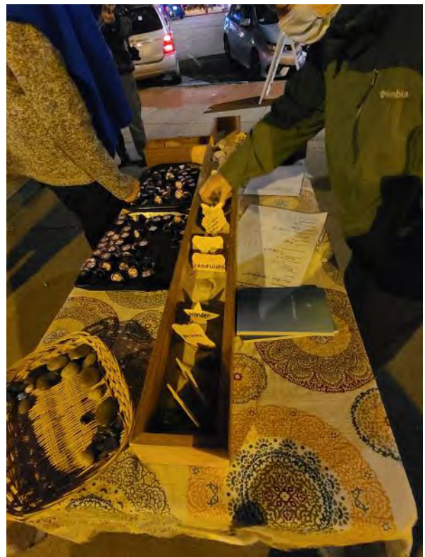
Giving offering at Dec., 5th Cathedral in the Night worship service