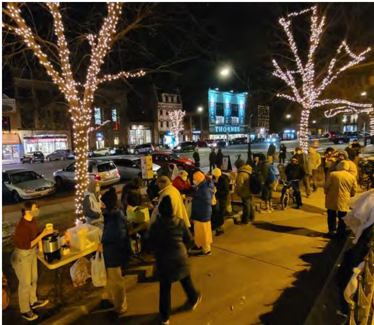
CITN & Edwards Church volunteers serving dinner on December 5t