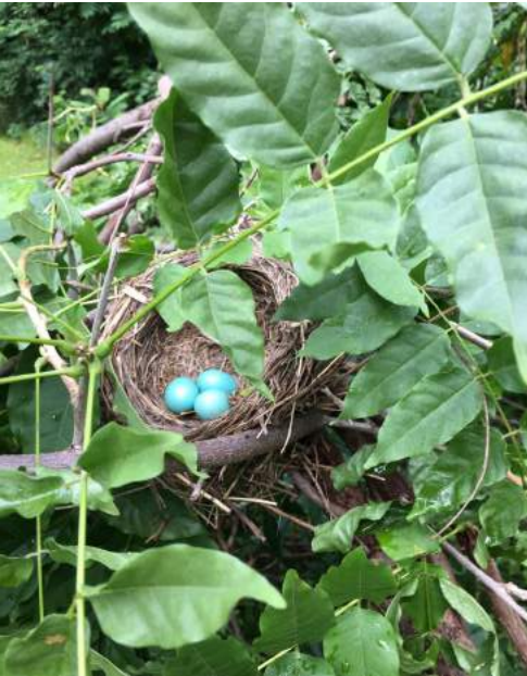
The Future is Hopeful