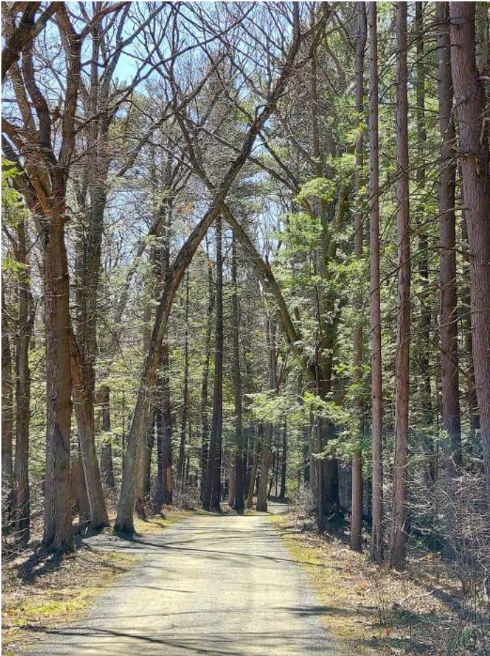
Among the Trees