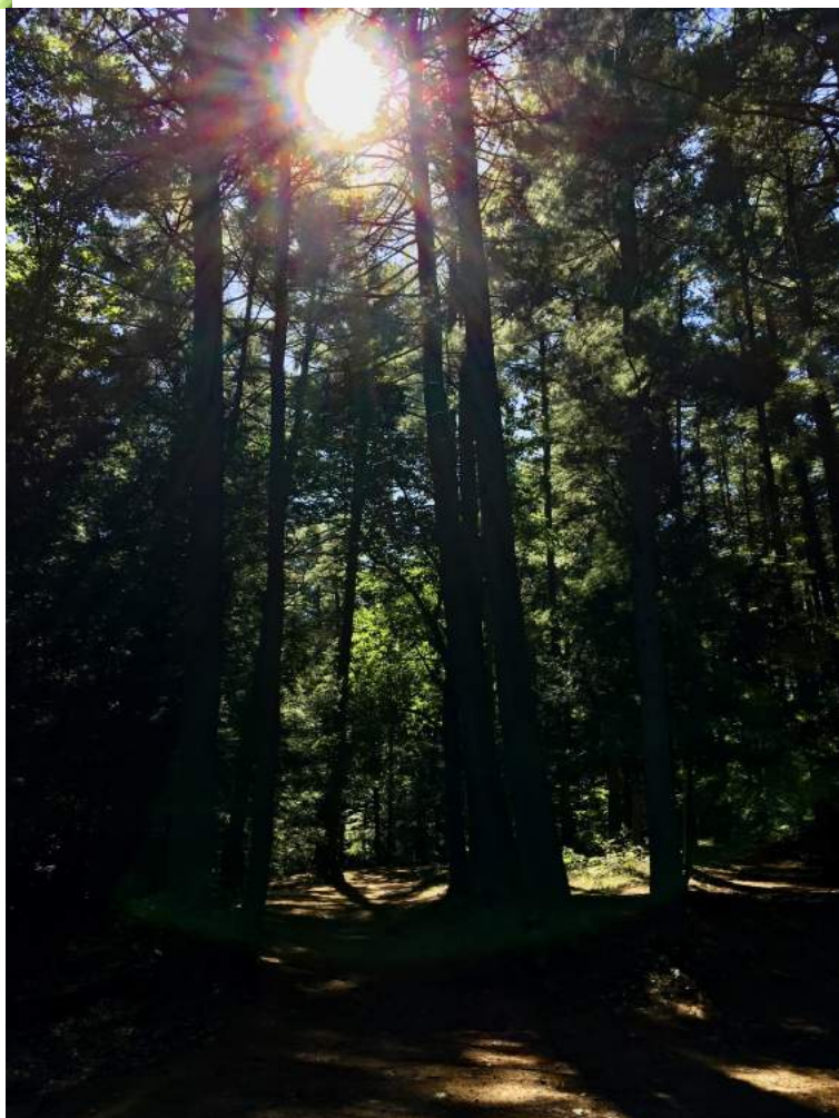
Cathedral in the Woods

By my pet bee who never minds me photographing him