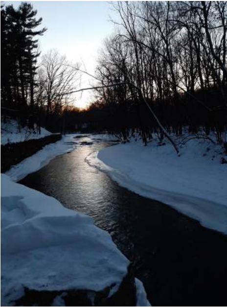
The Mill River in winter -Danny Shanahan

A compilation of pictures from our Edwards Church community