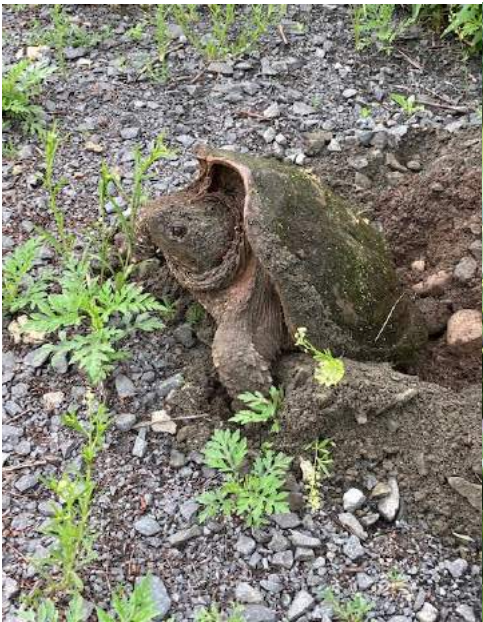
Life Renews Persistently