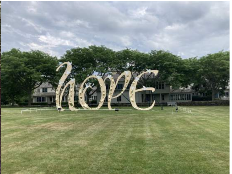
It Makes Crystal Clear What I Need to Remember