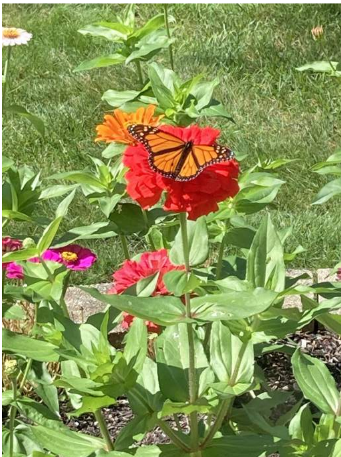
A Surprise Visit and Instant Smile