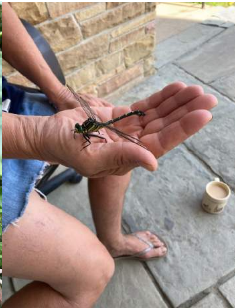
She's Got the Whole World in her Hand