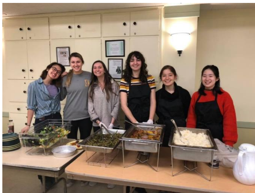
Smith College and UMass Amherst student volunteers serving food at MANNA Soup Kitchen